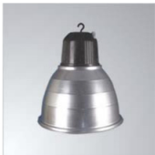
Relative intensity \pm 25^\circ